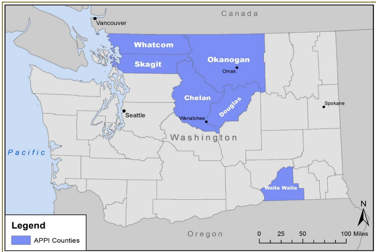
Figure ES.2. Map of APPI sites